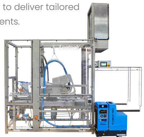
CS1000 Stainless Steel Case Sealer with Repositioned Control Panel