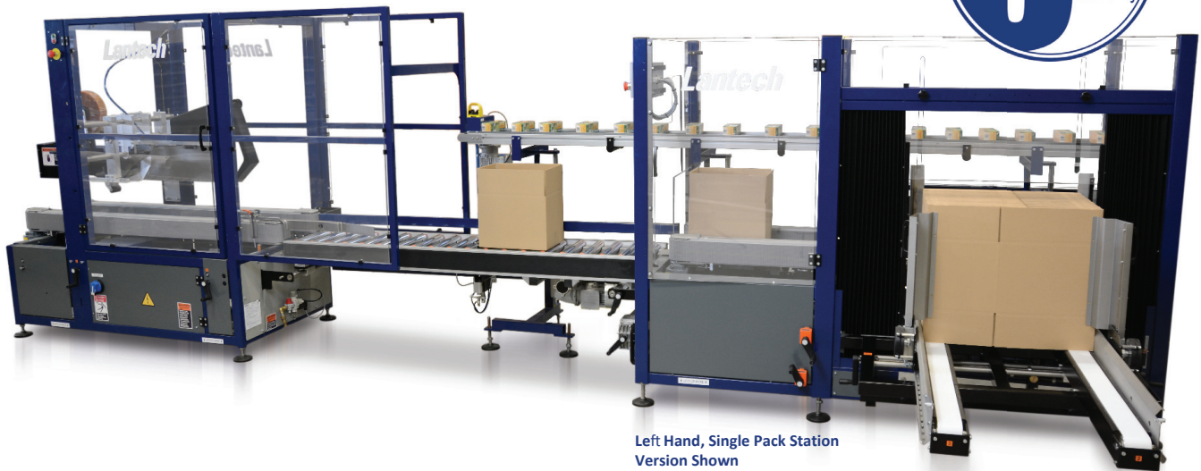
Left Hand, Single Pack Station Version Shown