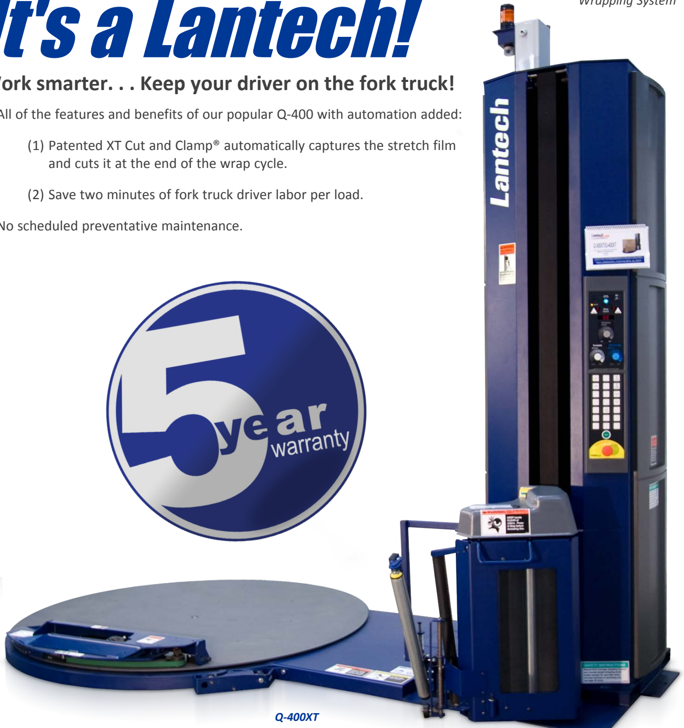
Q-400XT *Shown with Click-n-Go Remote Control option.

More Lantech field-tested packaging solutions @ www.lantech.com