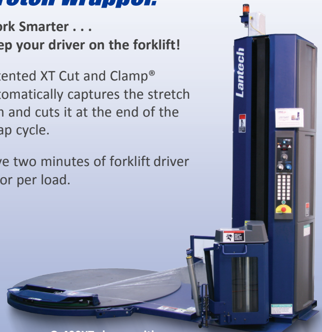
Q-400XT shown with C lick-n-Go Remote Control

Save two minutes of forklift driver labor per load.