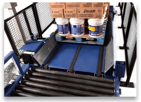
Guide rails help center the pallet on the conveyor.