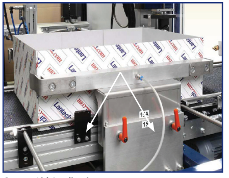
Square Lid Application While the lid is being applied by the folding unit, the tray is held in a square position by 2 brackets for accurate lid application.

Blank Separation Special separators release only the leading blank to the pickup frame and retain the following blanks.