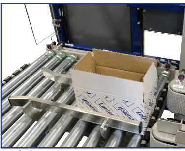
Guided Case Entry

Pre folding of the leading short flaps helps avoiding packaging damage and improves the reliability of your packaging process.