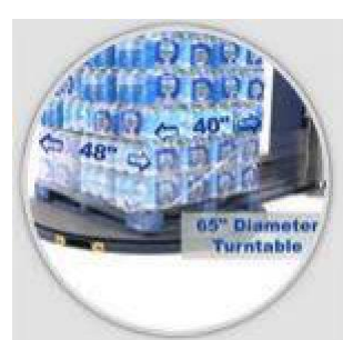
65" Diameter Turntable Standard 40" x 48" pallet fits entirely within the turntable, reducing the risk of damage or injury from overhanging pallets.