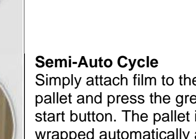
Simply attach film to the pallet and press the green start button. The pallet is wrapped automatically and consistently. Just cut the film and remove the load.