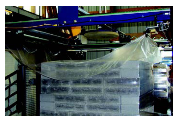
Protective moisture barrier (polyethylene sheet) automatically applied to top of load during the wrapping cycle. Top sheet securely held on load with spiral wrapping.