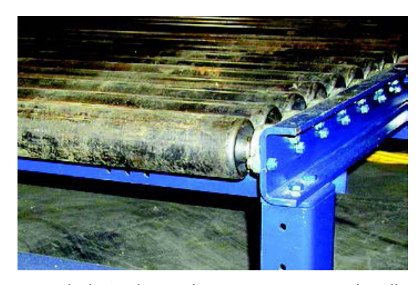
Lantech-design heavy duty conveyor system handles the heaviest brick and block loads - up to 6000 lbs. Three year warranty, unlimited cycles.