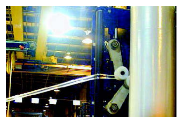
Film roping option. Film web is automatically collapsed into a high strength "rope" for even more containment.