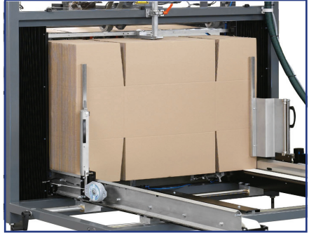
Blank Delivery Control

Powered belts precisely govern the delivery speed of the tray blanks. Blank retainers ensure the blanks are spaced correctly.