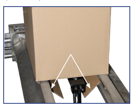
Stationary Flap Folding

Powered belts precisely govern the delivery speed of the case blanks. Blank retainers ensure the blanks are spaced correctly.