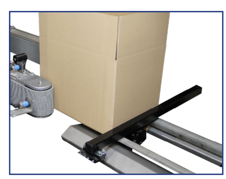
Square Case Transition

Special separators release only the leading blank to the pickup frame and retain the following blanks.