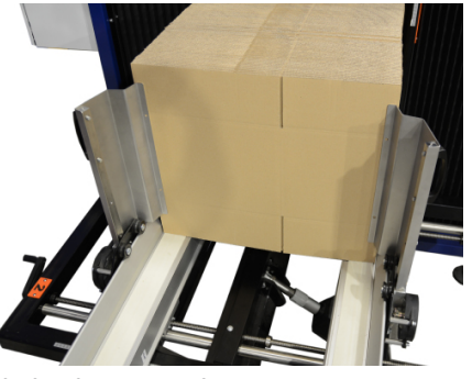
Blank Delivery Control

Eight vacuum powered suction cups hold the blank in the correct position after it leaves the magazine. Both leading panels are held securely.