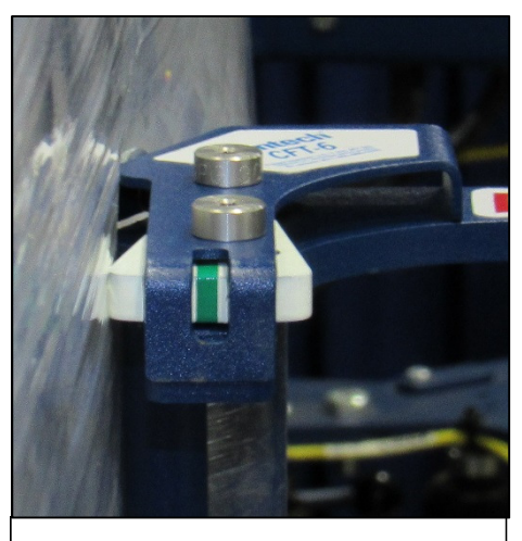
Figure 8 – Position Indicator