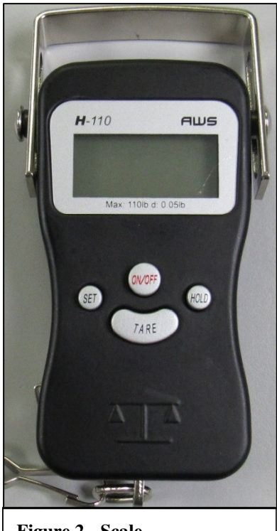
Figure 2 - Scale

"Tare" – This button resets the display to 0.