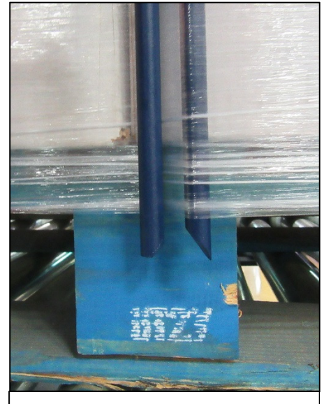
Figure 9 – Piercing Finger Position on the Film Cable.