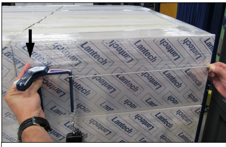
Figure 5 – "Piercing Finger" Position