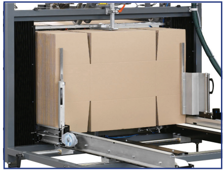
Blank Delivery Control

Powered belts precisely govern the delivery speed of the tray blanks. Blank retainers ensure the blanks are spaced correctly.