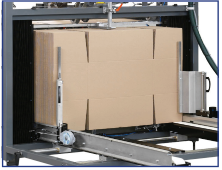
Blank Delivery Control

Powered belts precisely govern the delivery speed of the tray blanks. Blank retainers ensure the blanks are spaced correctly.